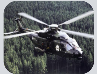
China Z8 Helicopter