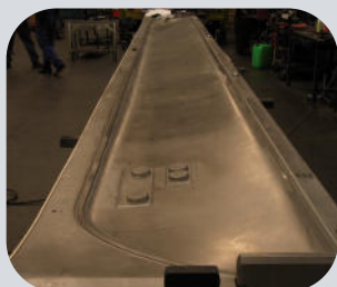
Mould for helicopter blades