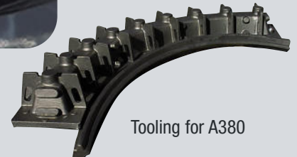
Tooling for A380