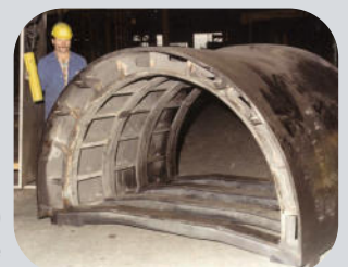
Tooling for A380 engine nacelle