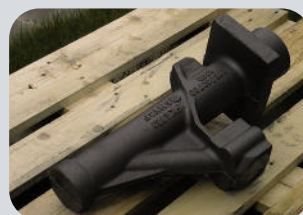
Tooling: Goose-neck for Magnesium die casting