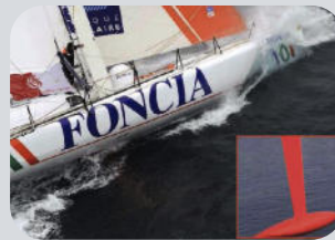
Special Applications: Sailing boat keel