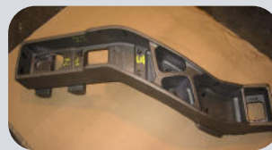
Medical: Arm for X-Ray table