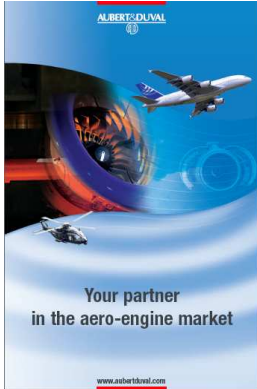
One of the booth posters