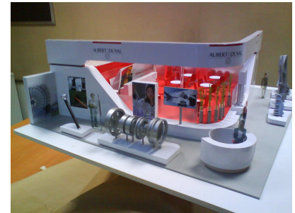
Model of A&D exhibition booth (150 m 2 )

From June 15 to 21, Aubert & Duval exhibits at the largest world biennial Aerospace show, with professional attendance from Monday to Thursday and public attendance from Friday to Sunday.