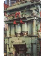
65KT Press (Issoire)