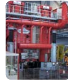
40KI Press (Pamiers)