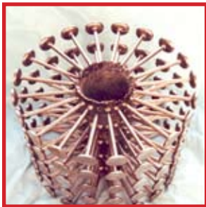
Centrifugal Cast TiAl Engine Valves

Alternatively, a pre-alloyed electrode can be purchased from an outside source at considerable expense. An ISM furnace by comparison, can use nearly any type of charge material that will fit within the confines of the crucible. Revert, commercially purchased scrap, loose turnings, and sponge can be charged directly into the ISM crucible and melted successfully. The variety of materials available for use as well as the minimal amount of pre-charging prep work greatly reduces the cost of raw materials. The direct result of this is a lower cost per part for an ISM cast product.