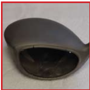
Golf Club Head

The vigorous stirring that is inherent in the ISM process is another advantage versus the VASC equipment. With little or no stirring in the VASC melt pool, homogeneity of alloying elements is difficult to achieve and is another reason for 'double melting' of charge material. In ISM, the four quadrant stirring generated by the induction field promotes uniform alloy composition and allows for dense, high melting point alloying elements to dissolve and be dispersed evenly. This allows for more complex alloys to be melted using the ISM process. The original patent holder alone is claimed to have cast more than 3000 different alloys.