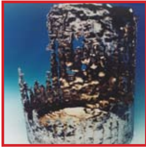
Skull after pouring

The ISM process has some inherent advantages over the Vacuum Arc Skull Casting (VASC) process that has traditionally been used in many titanium and reactive metal casting applications.